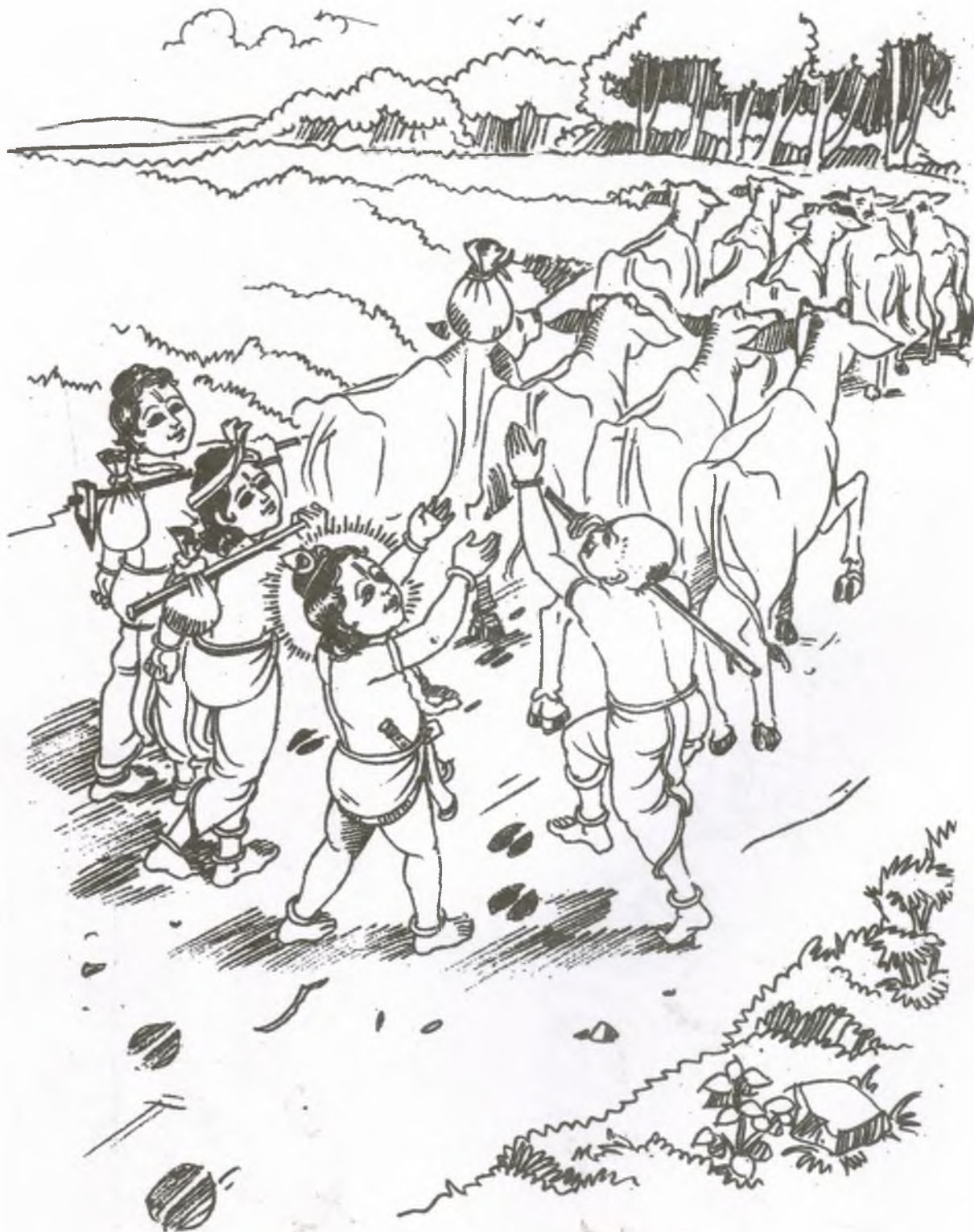
16. Krishna plays tossing the tiffins while going to the forest with His friends to tend the calves.