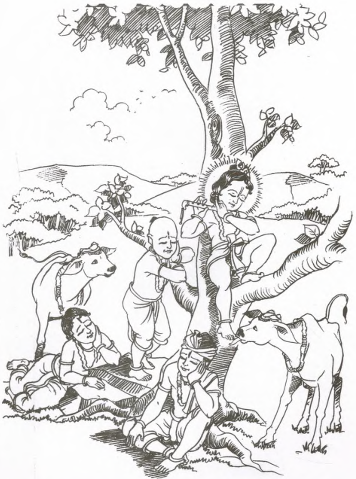
11. Krishna always carries His Flute with Him and when He plays on it, all the calves and His dear friends enchantingly get attracted to the sweet melody.