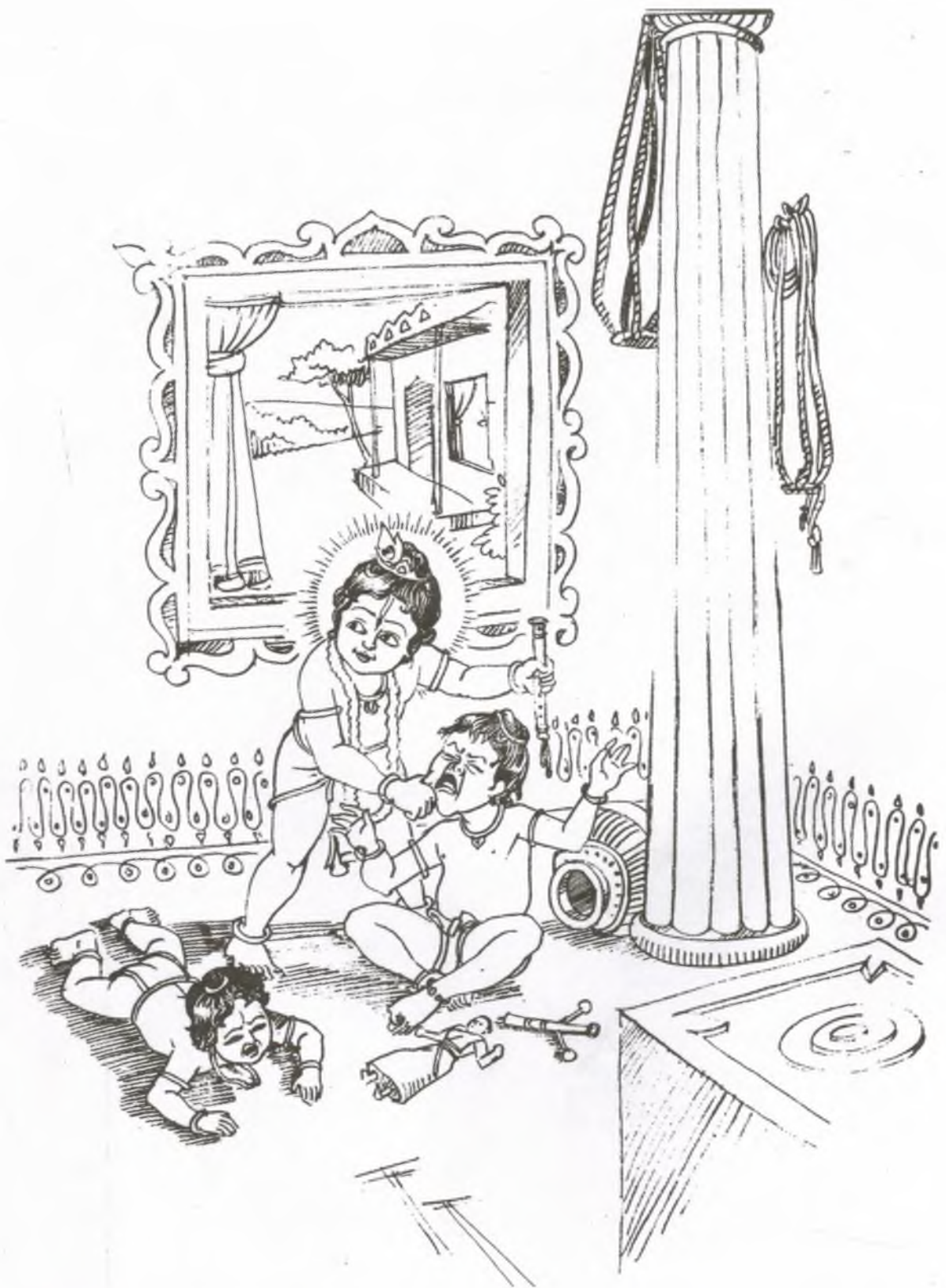
10. Krishna pinches the neighbour's kids to make them cry when He gets angry upon not finding butter in their houses.