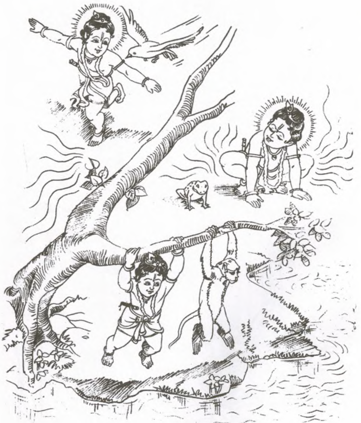
12. Krishna always imitates different birds and animals and plays with them.