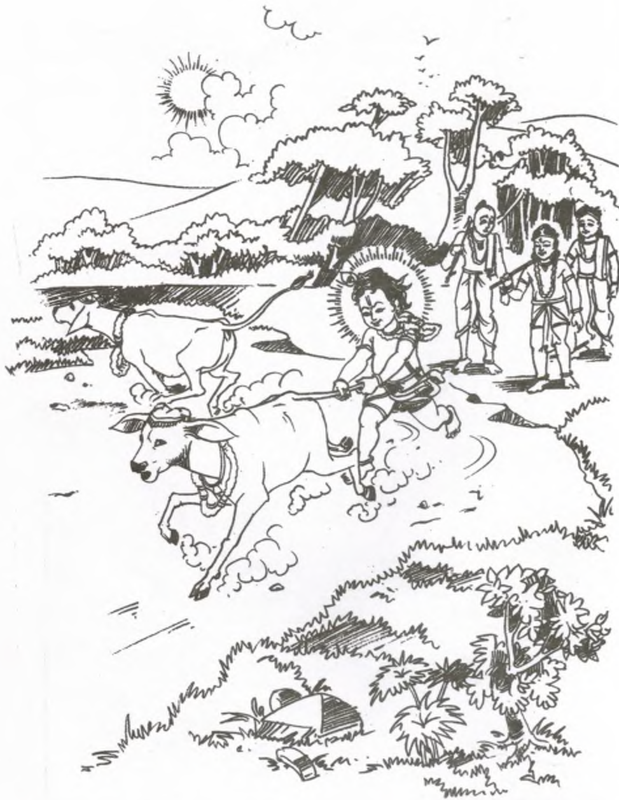
4. Krishna is always naughty and playful. He holds the calves' tails and runs behind them.