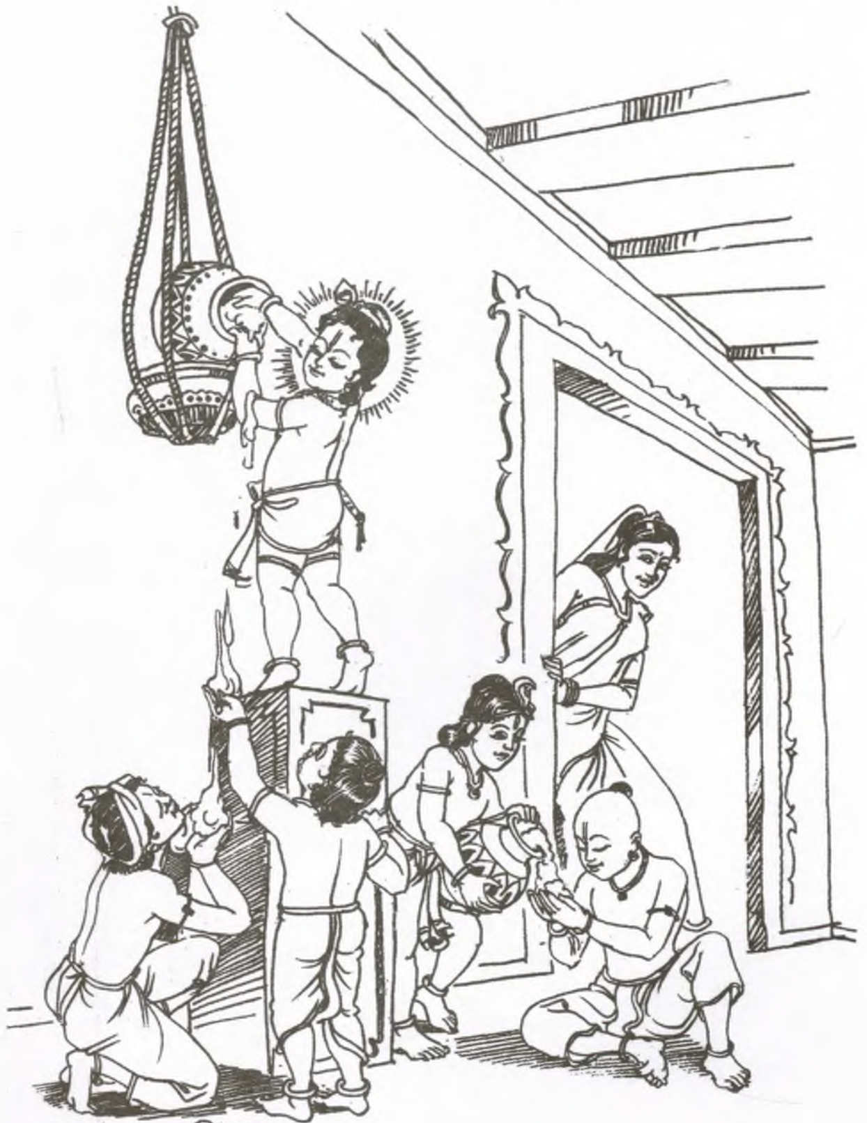
5. Krishna along with His elder brother, Balarama and other boys, steals the butter from the neighbor's house and the neighbors enjoy watching Him stealing.