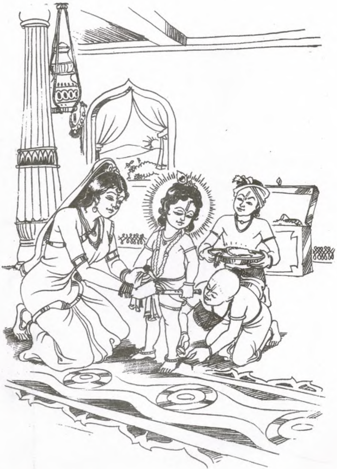
3. Daily Mother Yasoda bathes, dresses and decorates Krishna with nice clothes, jewellerys and ornaments. While she decorates Krishna, other boys would try to help put on Krishna's ankle bells etc.