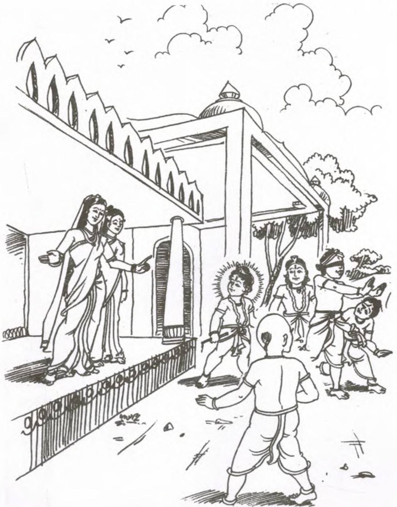
13. Mother Yasoda calls Krishna if He is late for His lunch when He is still engaged in playing with His friends.