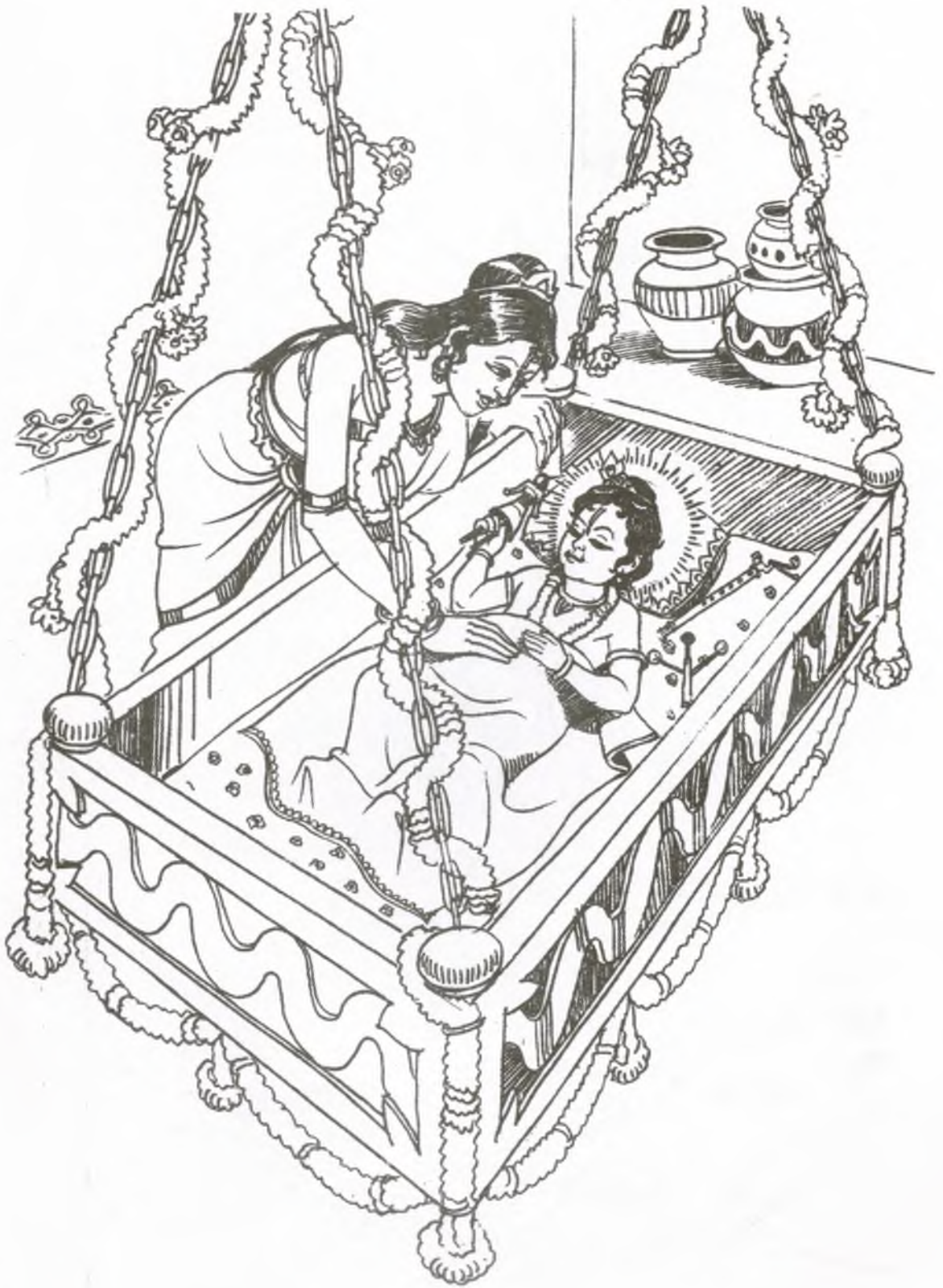
1. Daily, Mother Yasoda wakes up baby Krishna early in the morning. Singing with her sweet voice the glories of Krishna, she wants to feed Him.