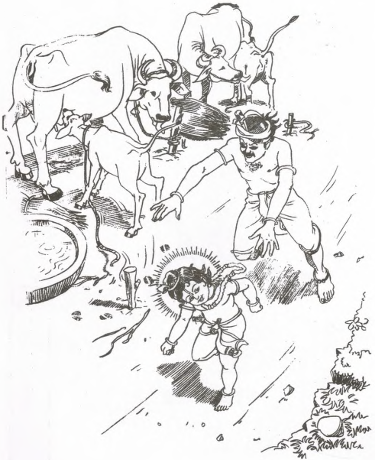
7. Krishna escapes from cowherd men who try to punish Him when He mischievously releases the calves to drink the milk from their mothers.