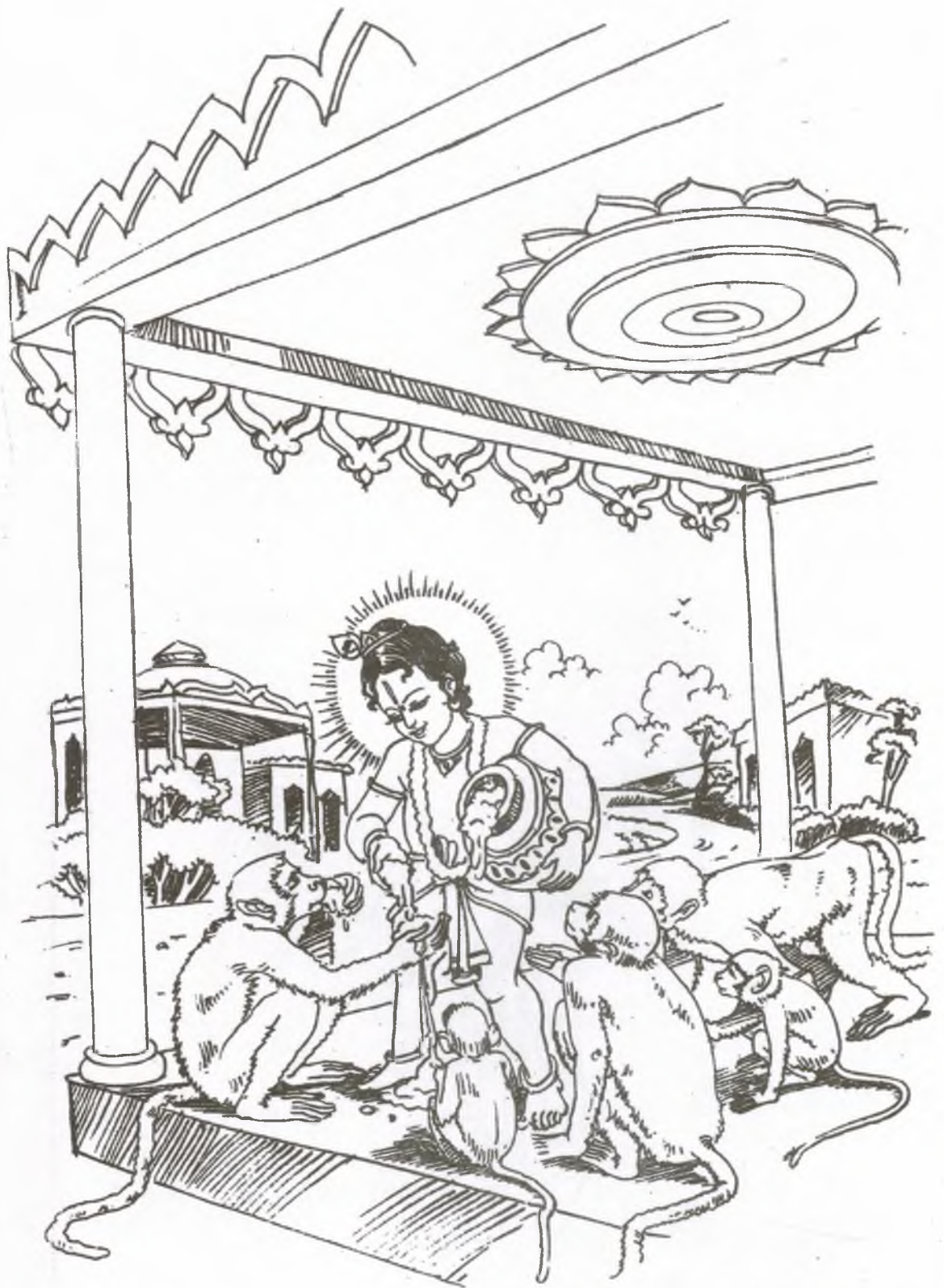
6. Krishna takes pleasure in distributing the stolen butter to the monkeys.