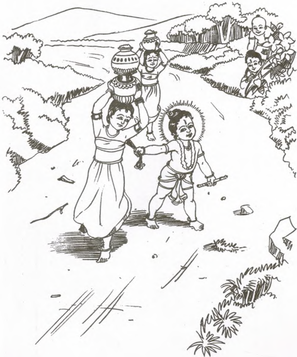
9. When the young girls carry curds and butter on their heads to sell, naughty Krishna teases and amuses them.