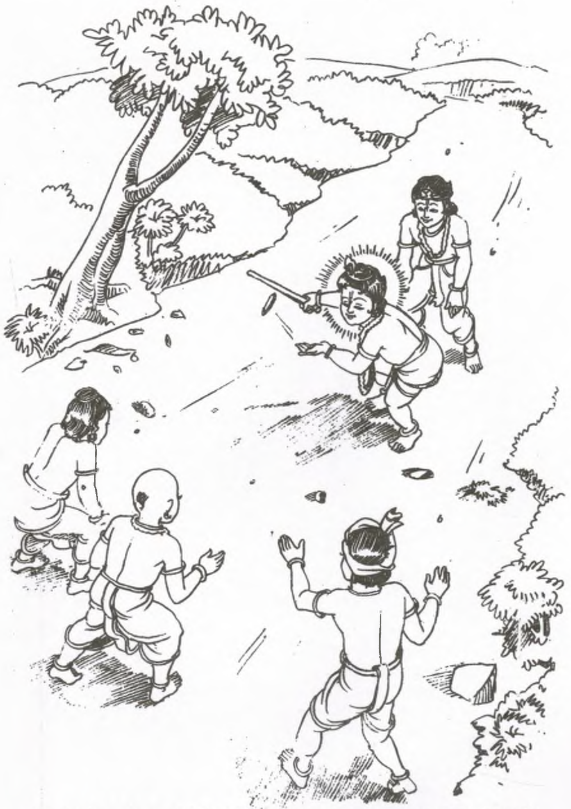
15. Krishna plays with His friends "gulli-dand" as the village boys do.