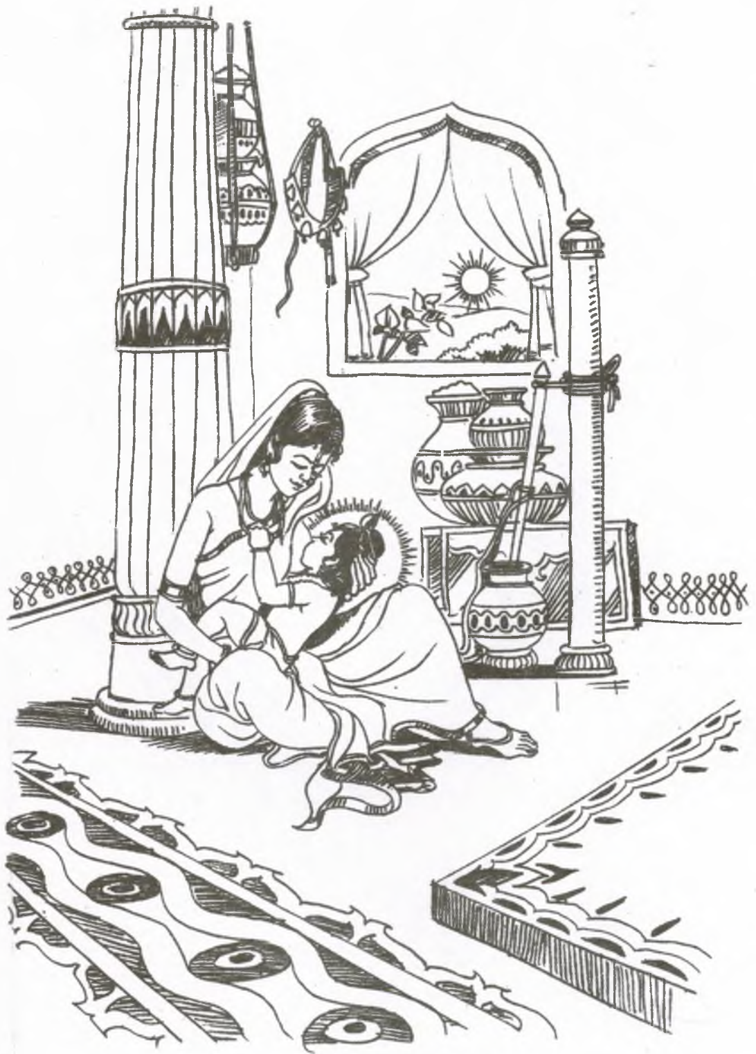
2. After rising early in the morning, Mother Yasoda takes Krishna in her lap and gives him her breast milk with great affection and love.