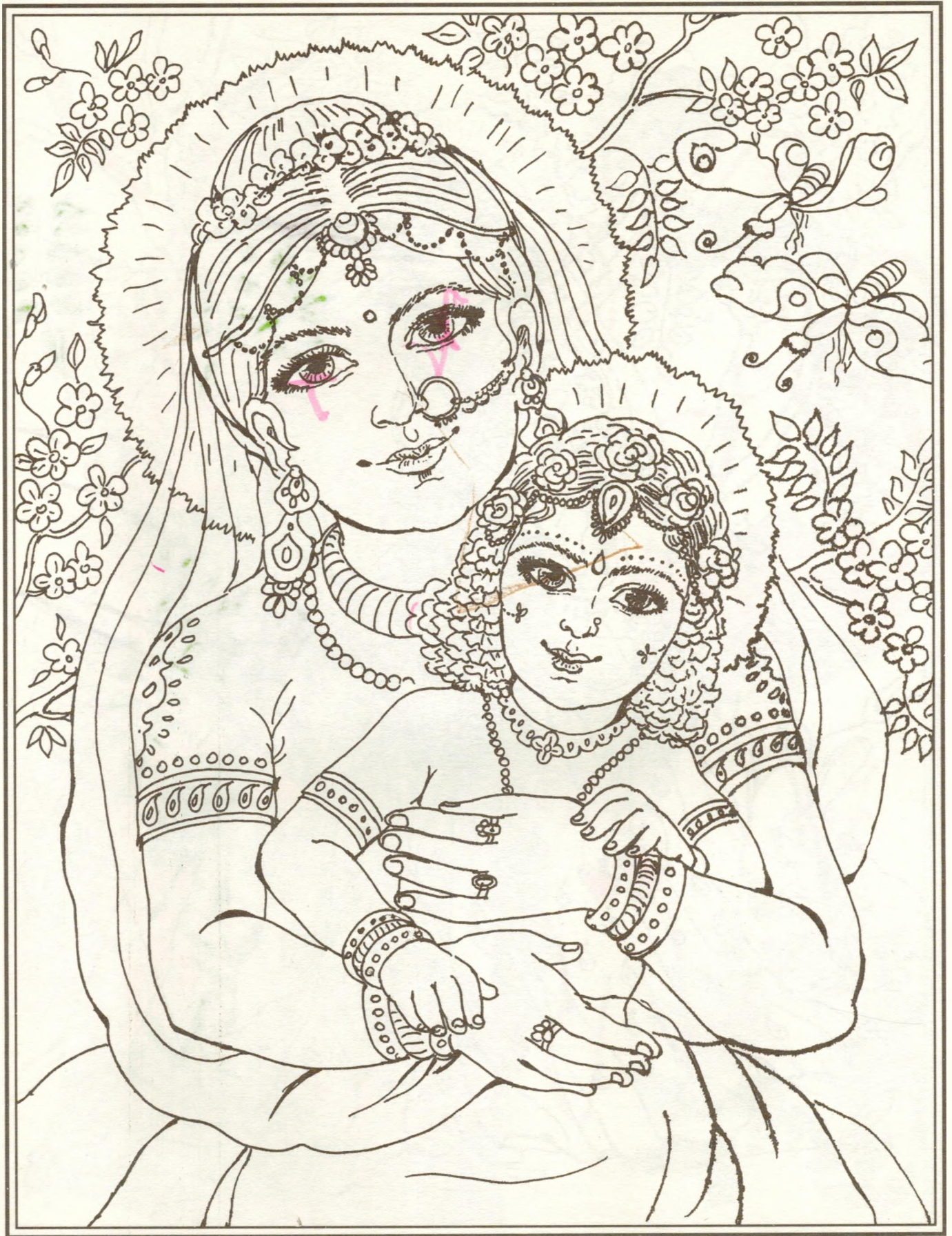
20. She is the reservoir of loving affairs in Gokula.