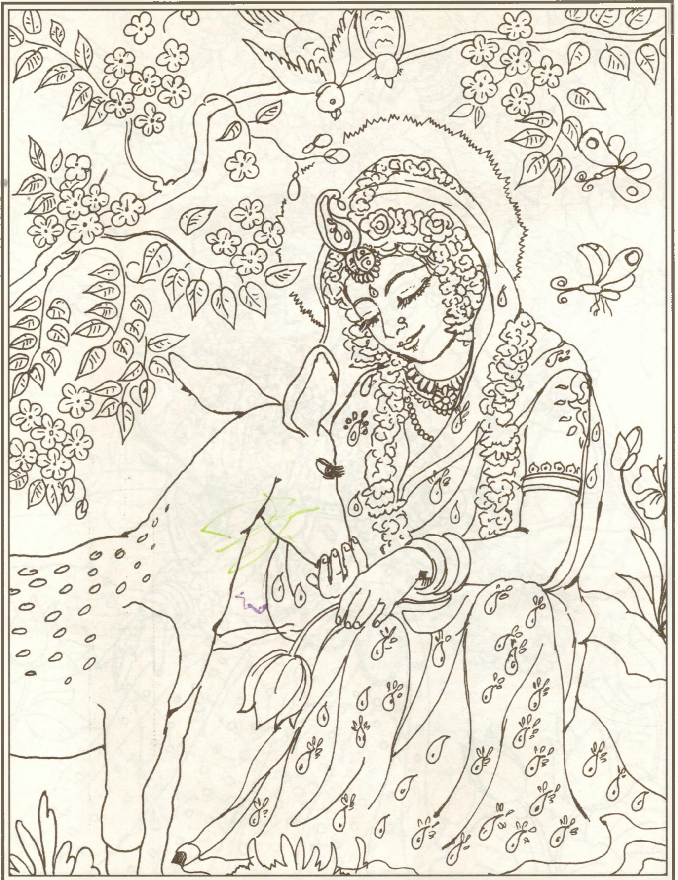
10. She is very humble and meek.