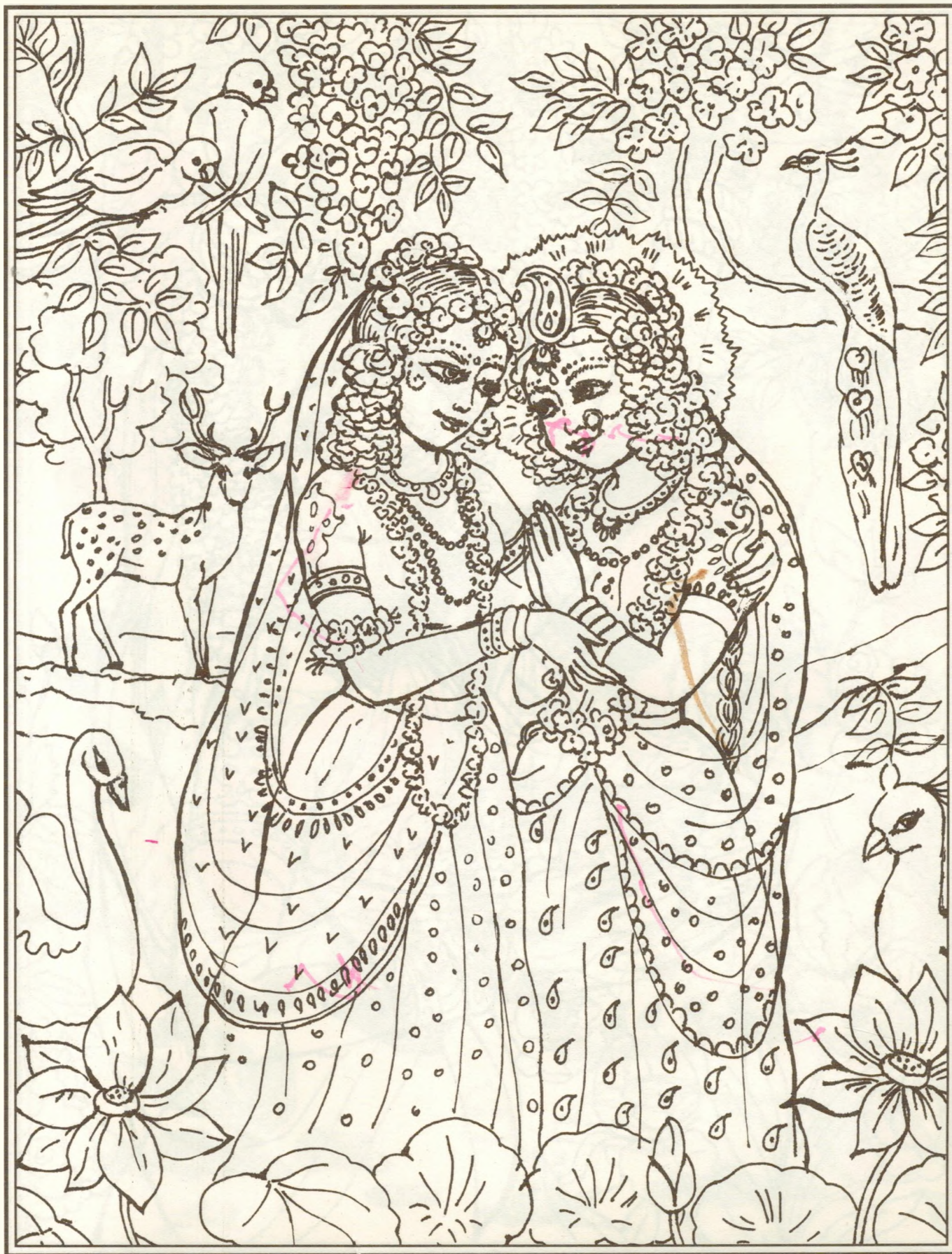
23. She is very submissive to the love of Her friends.