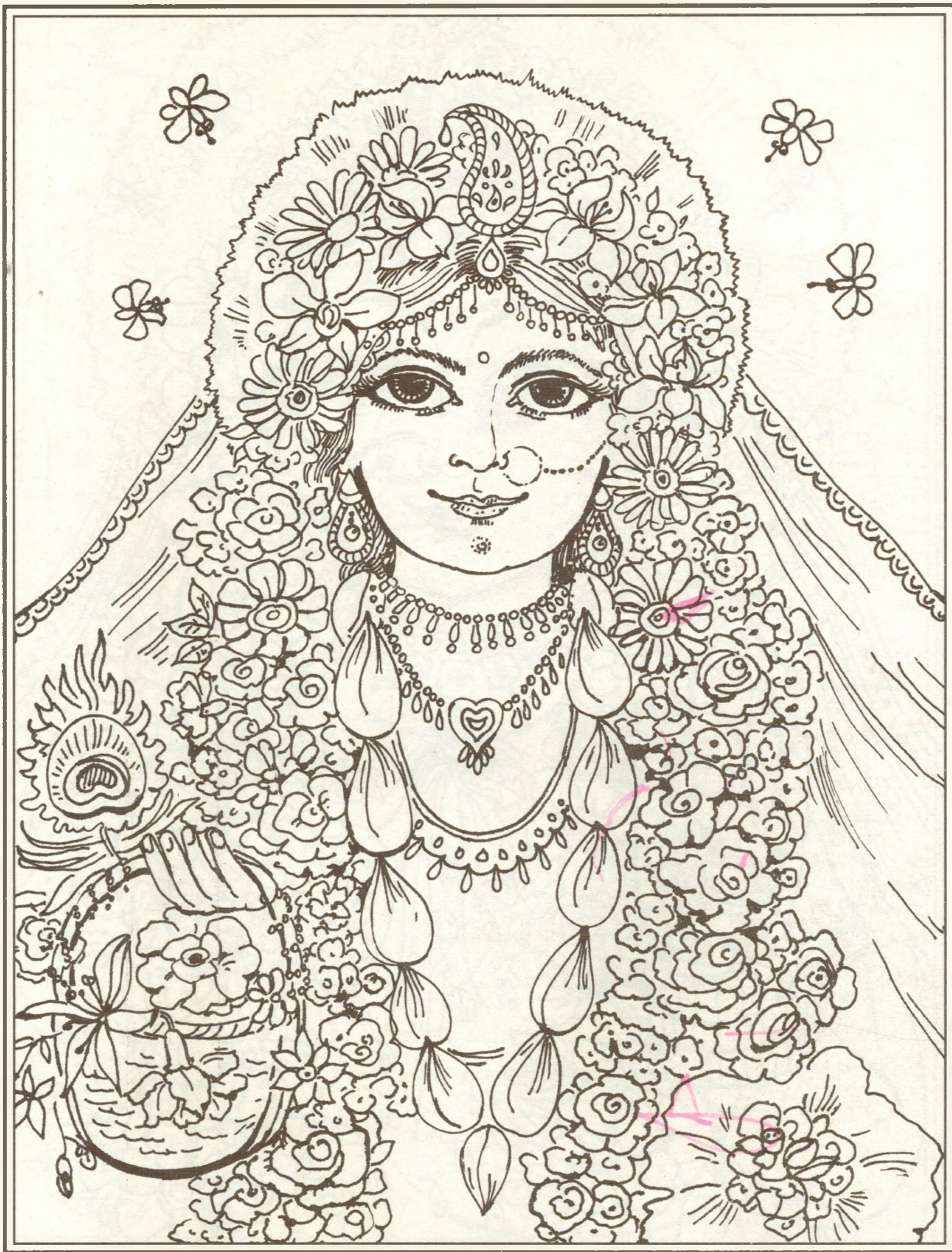
6. She makes Krishna happy with Her bodily aroma.