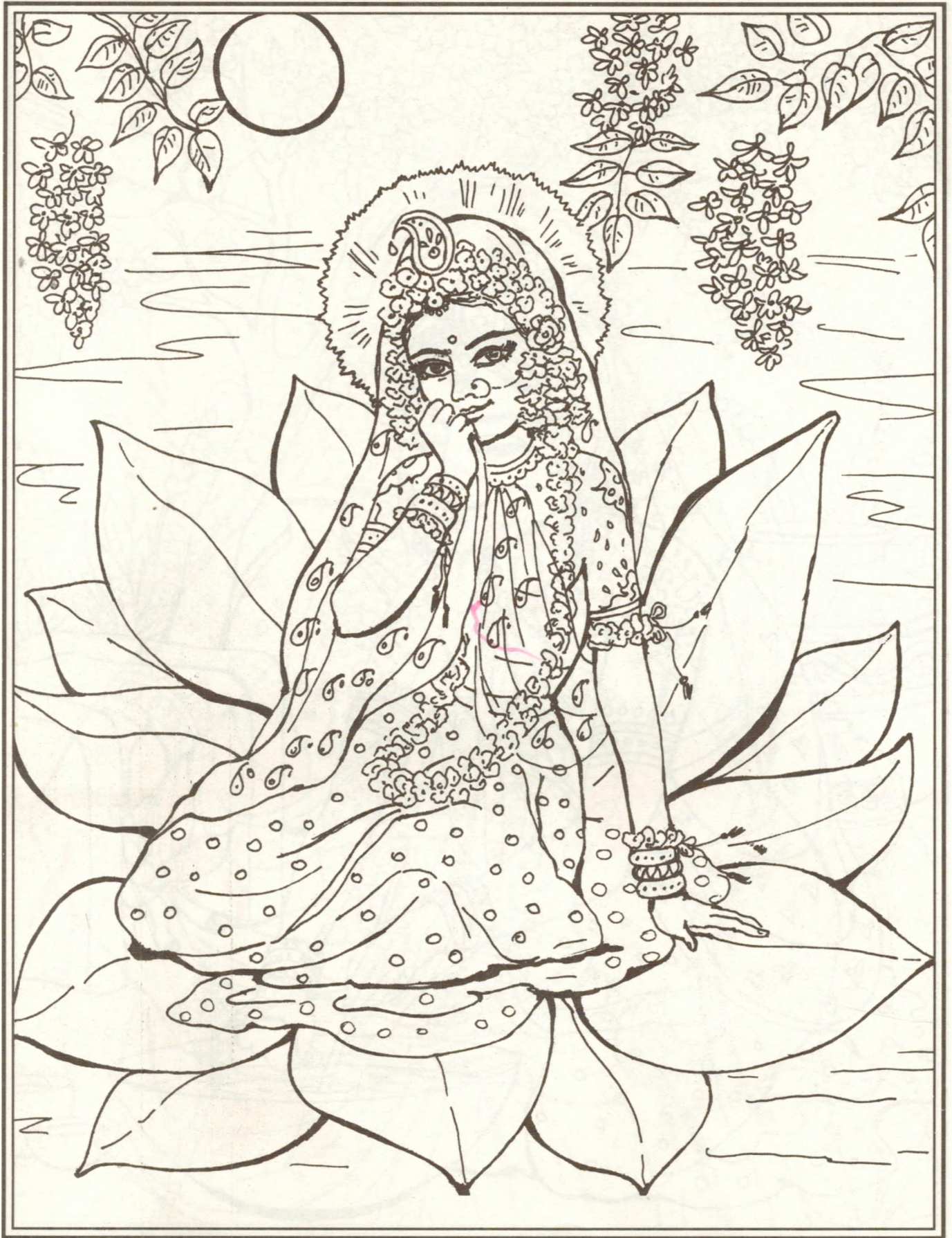
14. She is shy.