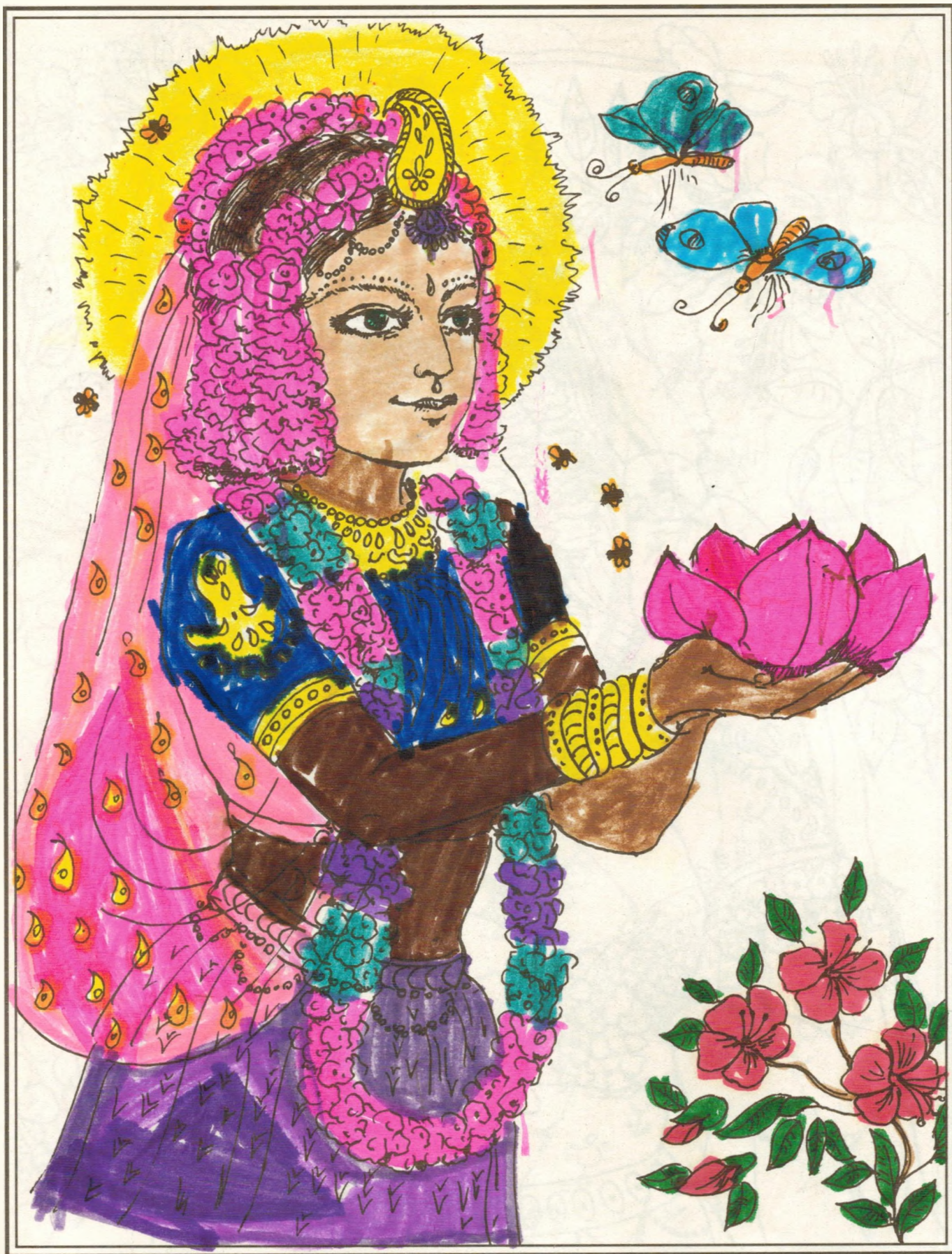
18. She is expert in enjoying life.