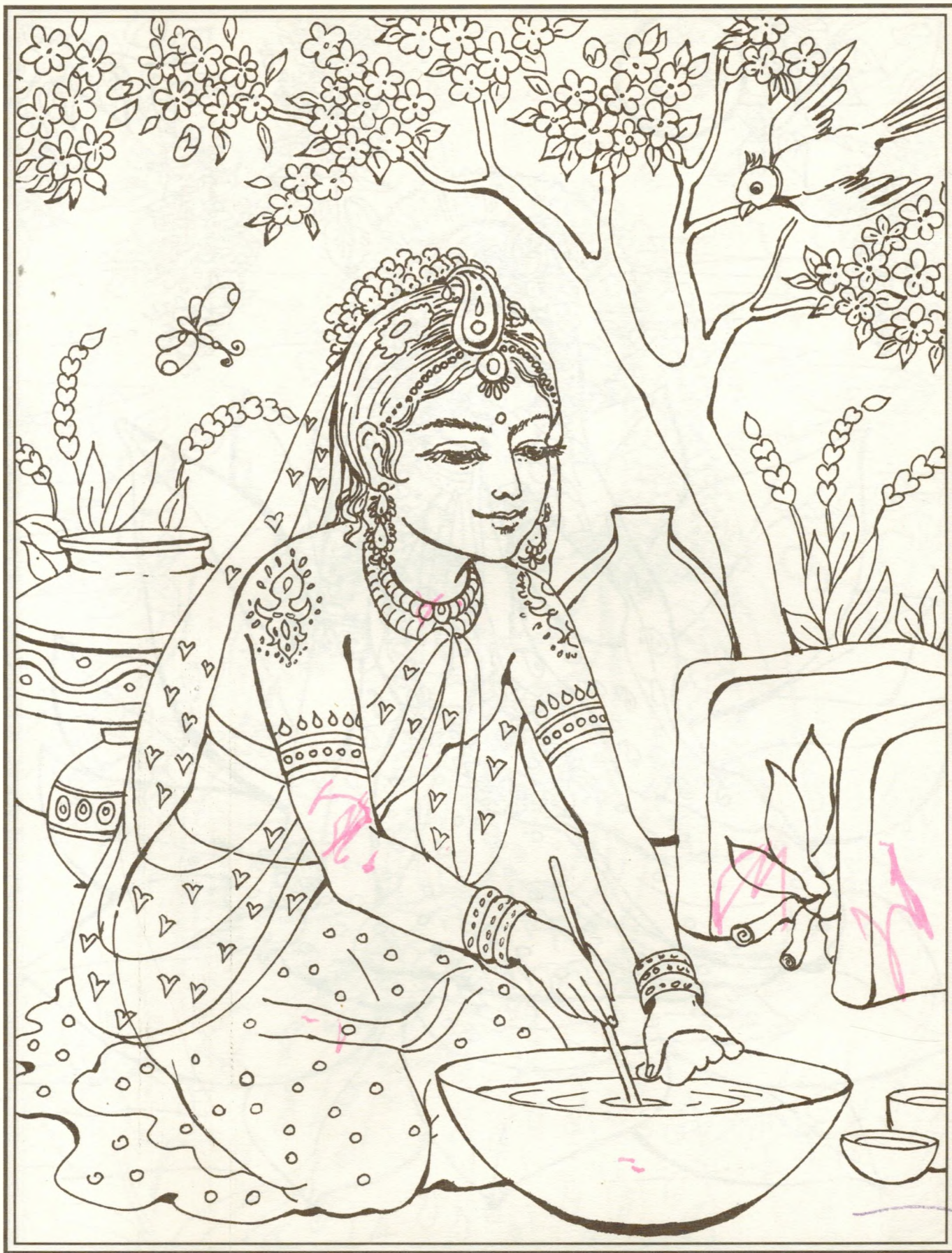
13. She is expert in executing Her duties.