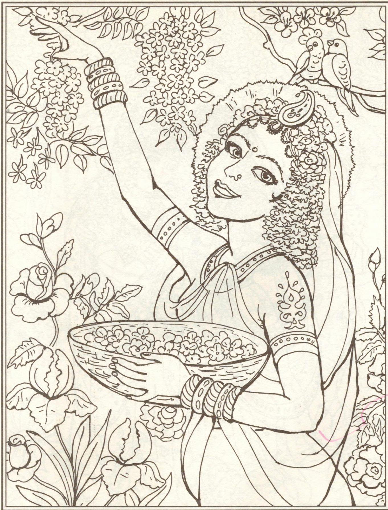
24. She is the chief gopi.