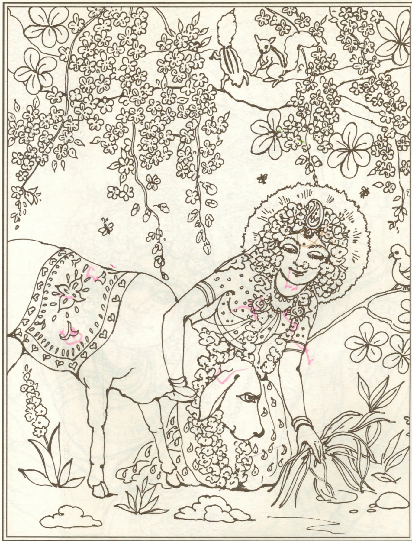
21. She is the most famous of submissive devotees.