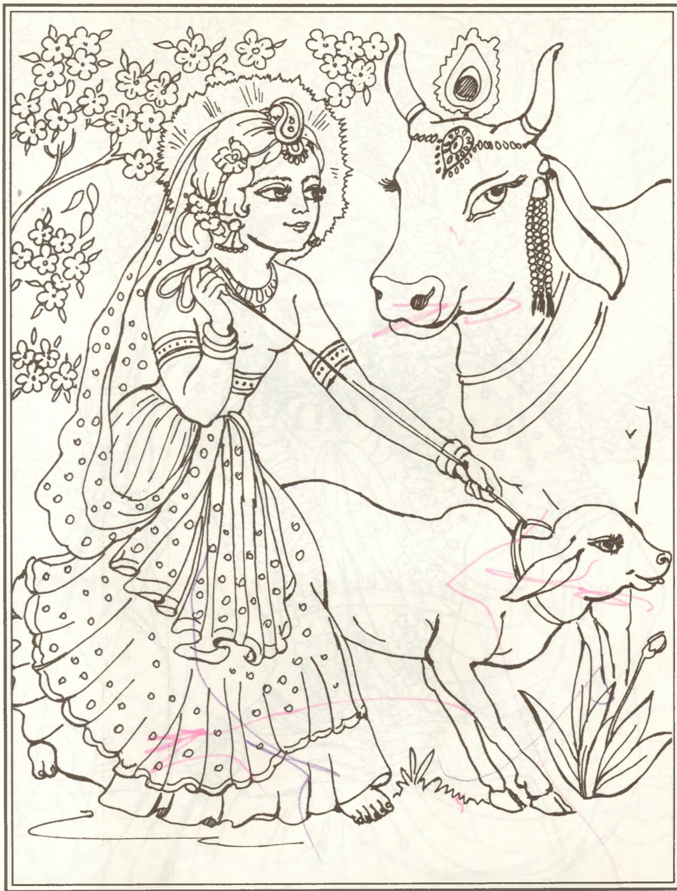
11. She is always full of mercy.