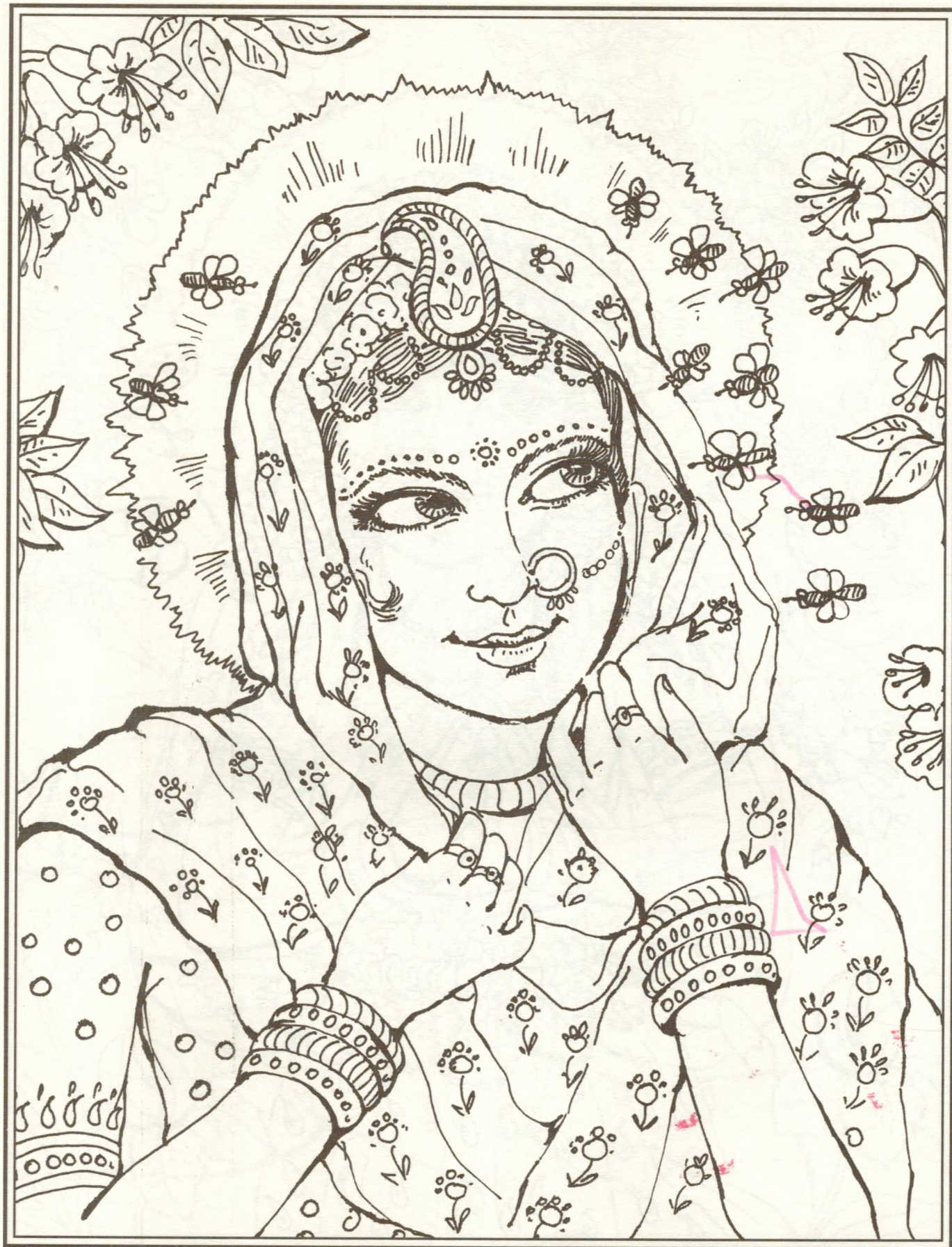
16. She is always calm.