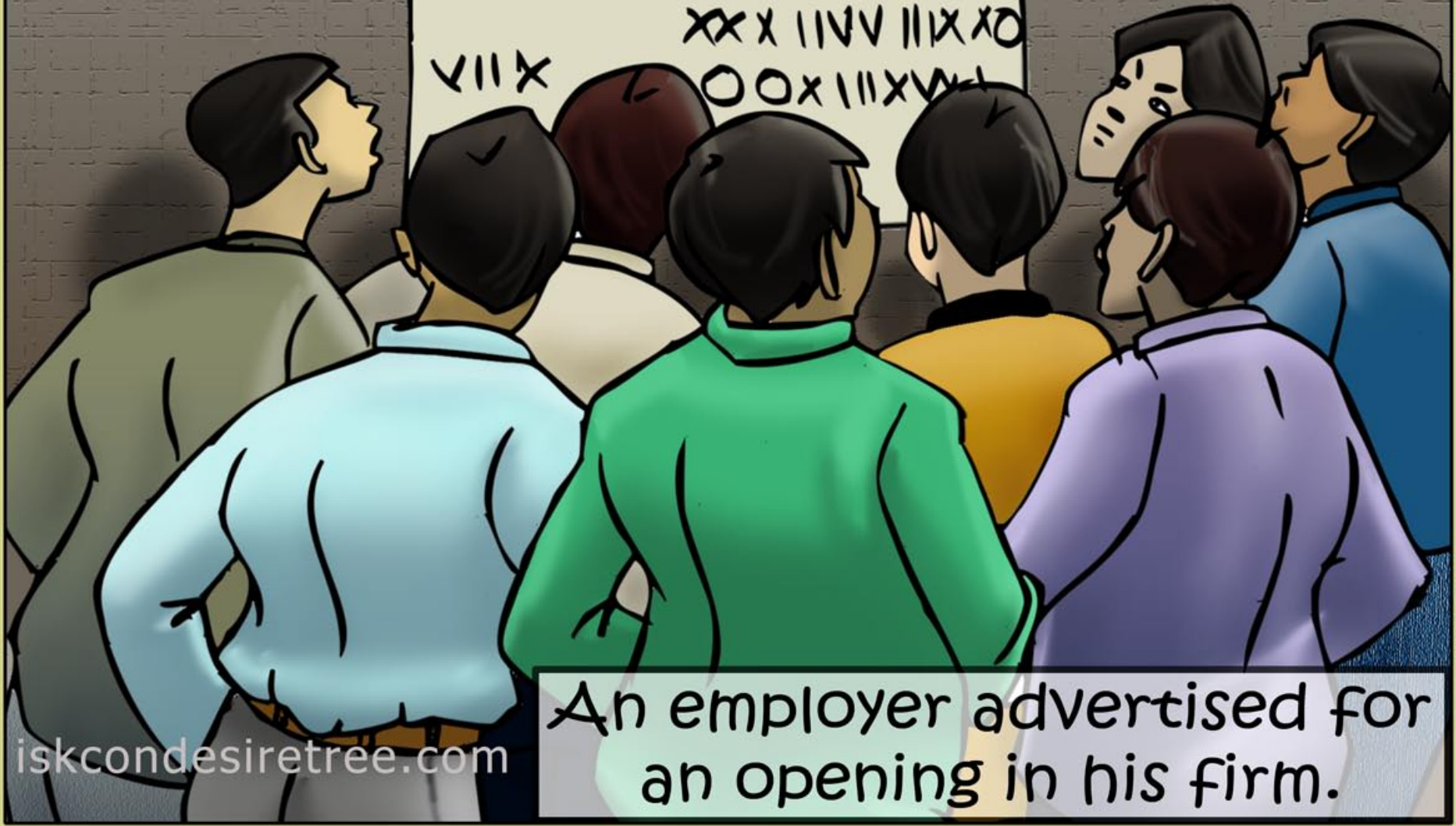
An employer advertised for an opening in his firm.