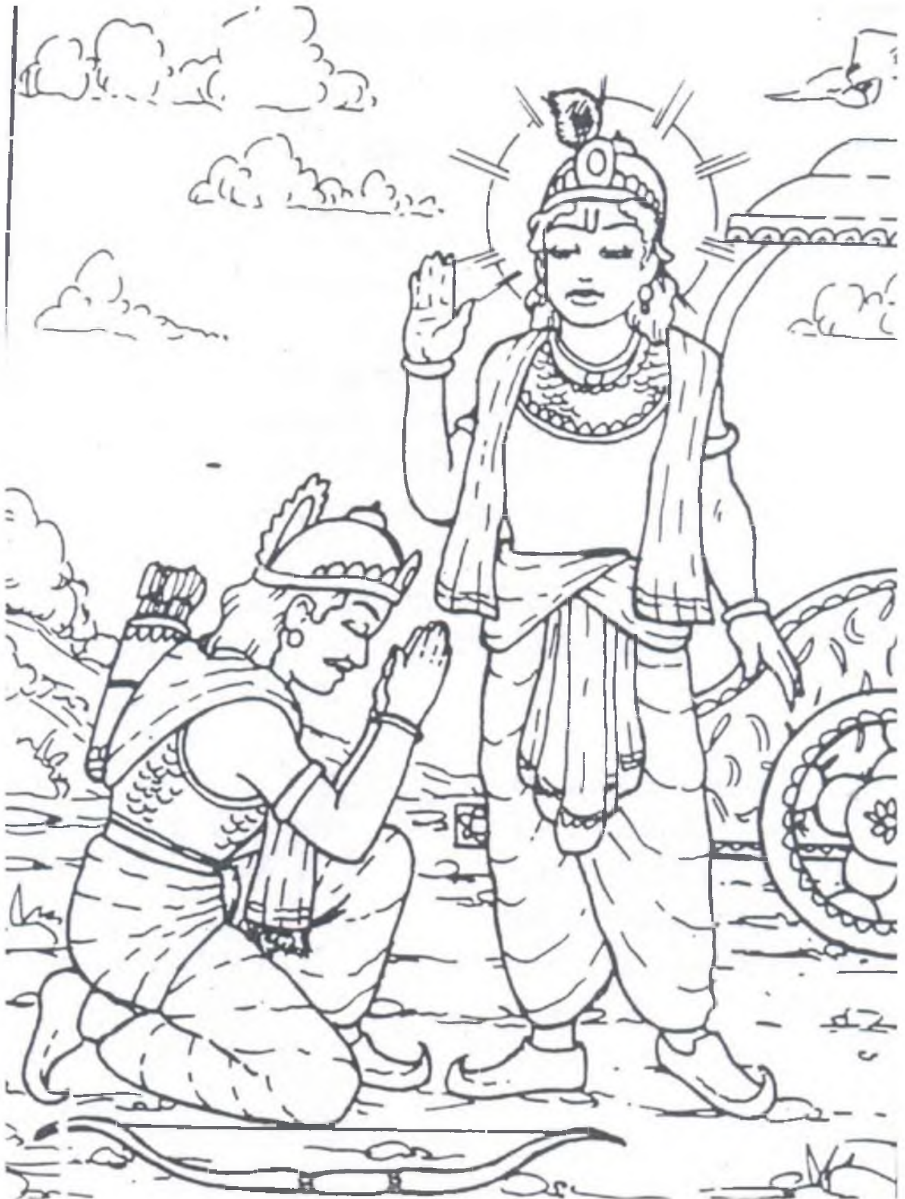
Krishna teaches the knowledge of Bhagavat Gita to Arjuna

Hare Krsna Hare Krsna Krsna Krsna Hare Hare Hare Rama Hare Rama Rama Rama Hare Hare