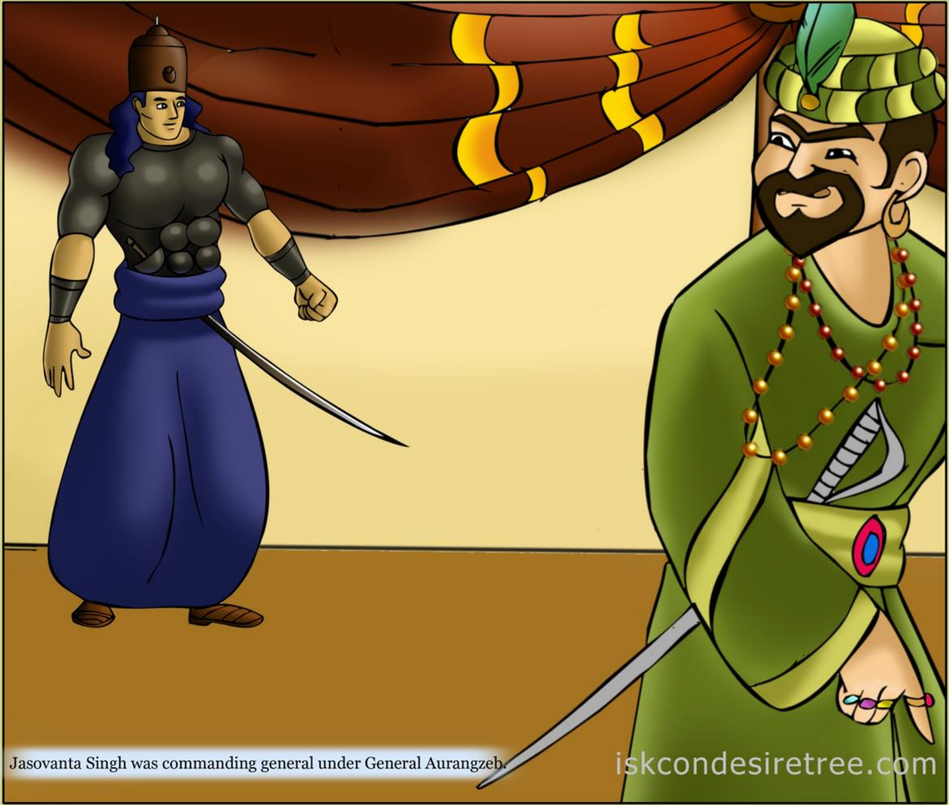
Jasovanta Singh was commanding general under General Aurangzeb.