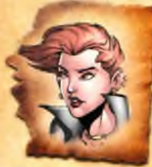
Bandra The Monkey