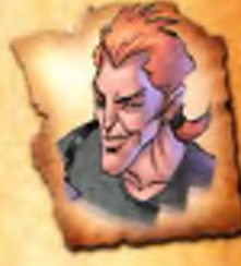
Jack The Jackal