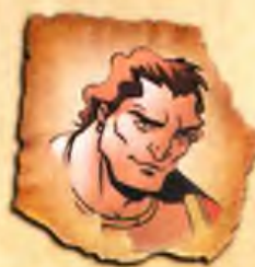
Nandy The Bull