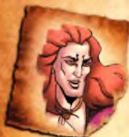
Lzo The Lion