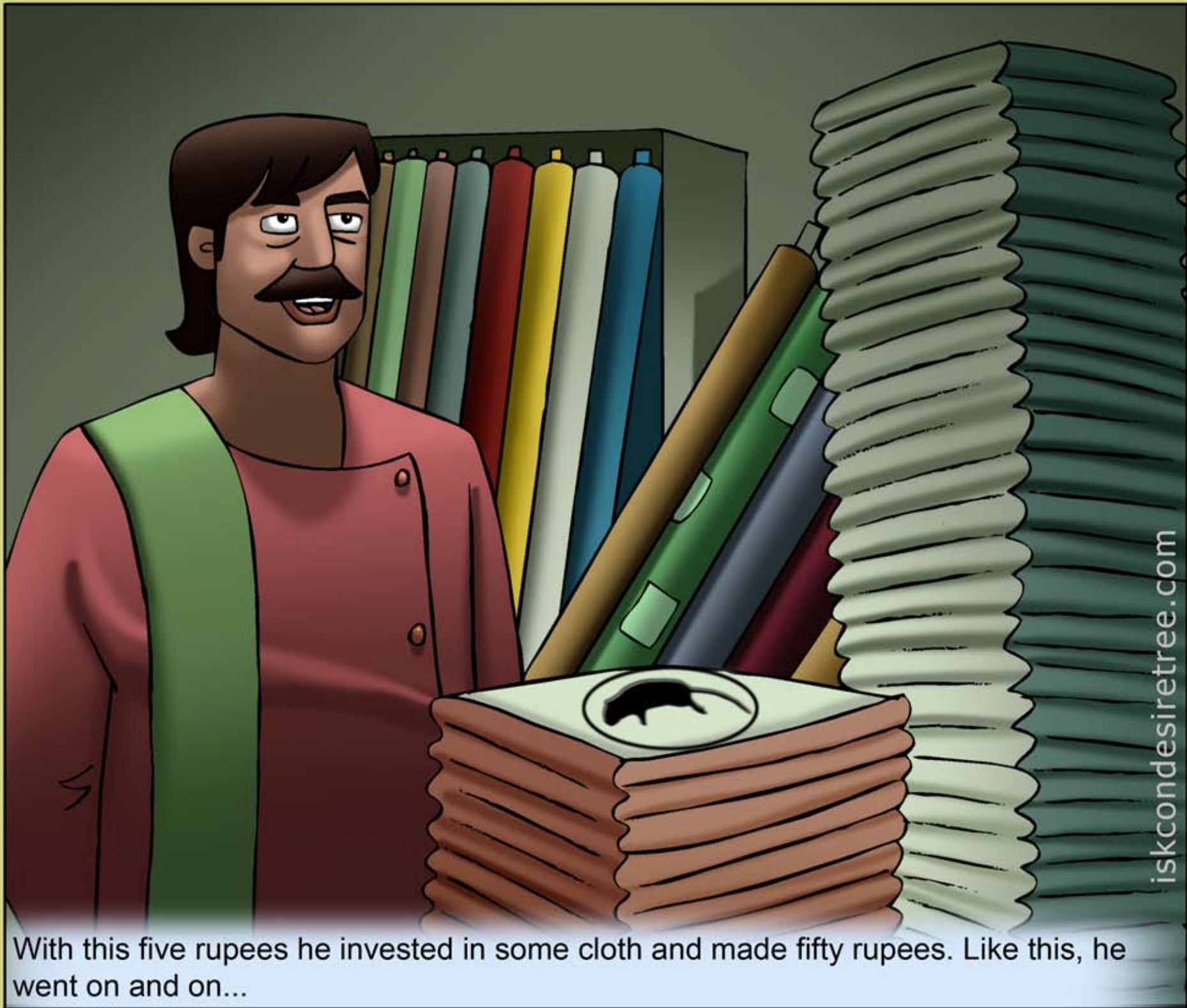
With this five rupees he invested in some cloth and made fifty rupees. Like this, he went on and on...