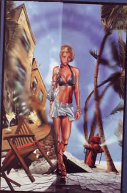
ISSUE 1 Greg Horn